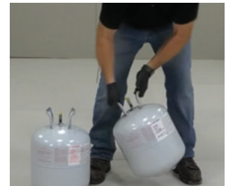
Shaking of A-side and B-side tanks