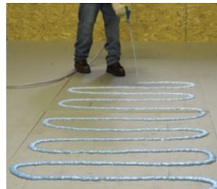
Apply using extension nozzle