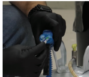
Application of petroleum jelly to spray gun