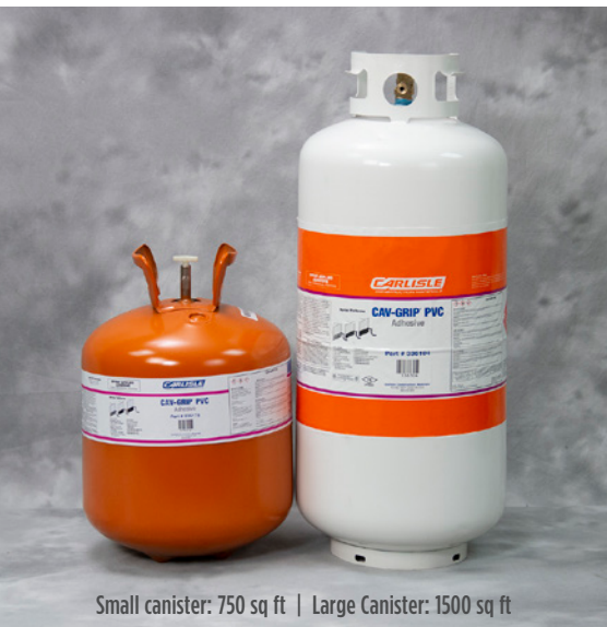
Small canister: 750 sq ft | Large Canister: 1500 sq ft

Revolutionize your adhesive needs with CAV-GRIP PVC Aerosol Contact Adhesive. This versatile solution is perfect for a multitude of applications, including securing PVC bareback membranes to various horizontal surfaces and vertical walls (excluding KEE of KEE HP bareback membranes) and achieving exceptional adhesion when attaching WeatherBond's Fleece membranes to vertical walls.