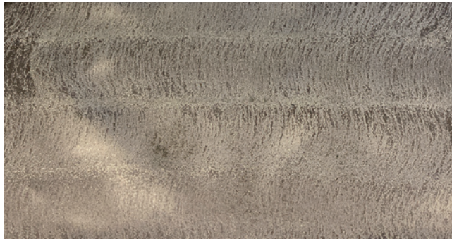
Proper Coverage on Membrane