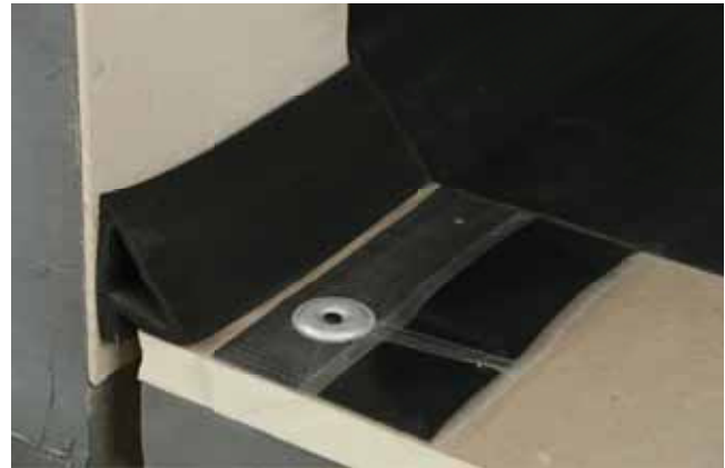
Edge Expansion Joint: Part Number 300471